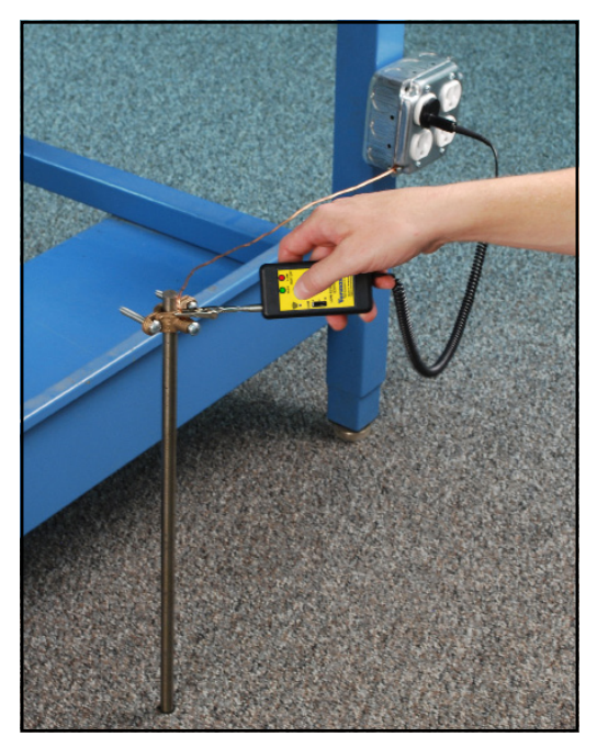
Figure 4. Testing auxiliary ground with the 222645 tester