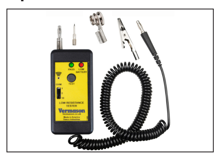
Figure 1. Vermason 222645 Low Resistance Tester