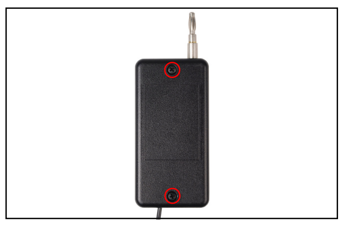
Figure 5. Locating the enclosure screws