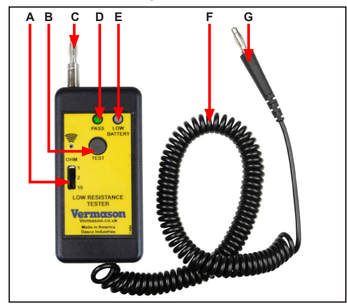
Figure 2. Low Resistance Tester features and components