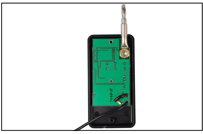
Figure 6. Removing the back cover