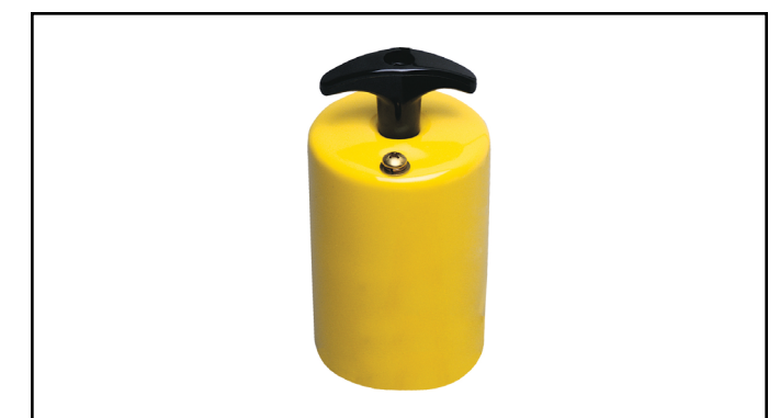
Figure 7. EMIT 50784 5-Pound Electrode for Limit Comparator

Pair the Limit Comparator with the EMIT 50784 5-Pound Electrode to verify the calibration of the footwear circuit in the SmartLog Pro<sup>™</sup>. The electrode provides a method to load the resistance from the Limit Comparator onto each plate of the SmartLog Pro<sup>™</sup> dual foot plate.