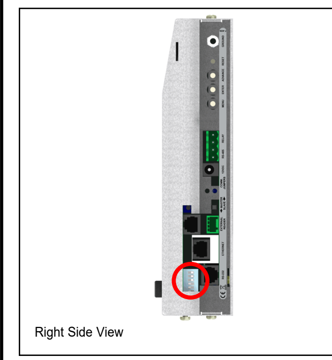
Figure 3. Locating the DIP switch on the SmartLog V5™

Figure 2. Locating the DIP switch on the Combo Tester X3 and Dual Independent Tester