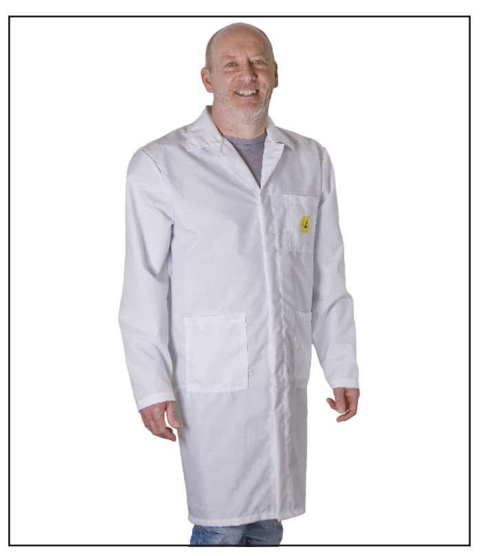
Figure 1. Charleswater Static Dissipative Lab Coat